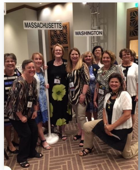
Massachusetts delegates pose during a break in the Business Session at GFWC Convention in Austin, Texas in June.