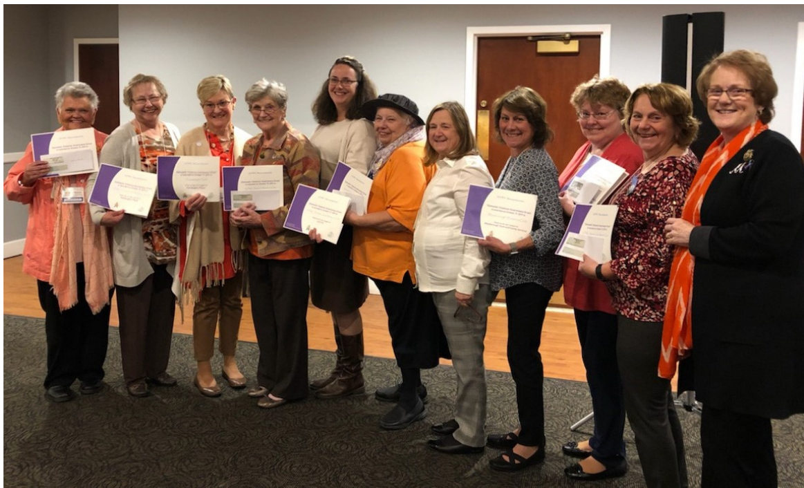
Awards presented at GFWC MA Fall Meeting