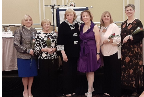
New England's Jennie Award Candidates