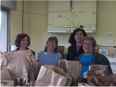
Needham Women's Club