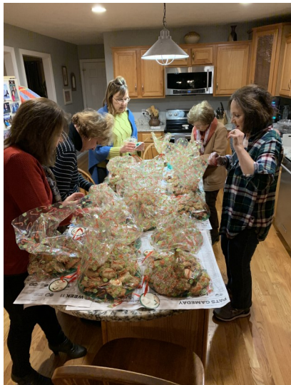
GFWC Blackstone Valley Women's Club