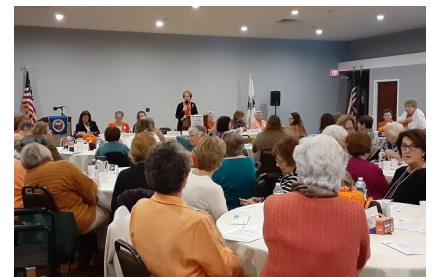
Fall Meeting, October 19, 2019