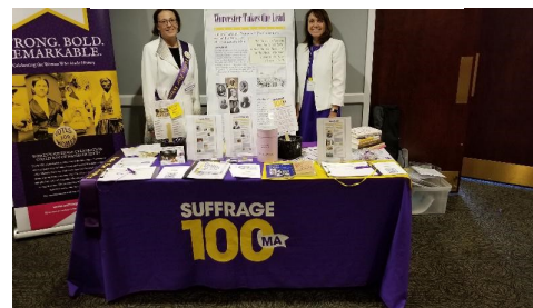
Women's Suffrage Celebration Coalition of MA