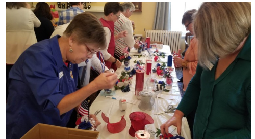
Junior Fall Conference