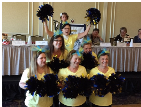
GFWC MA Cheerleaders!