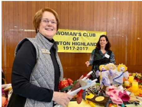
Woman's Club of Newton Highlands