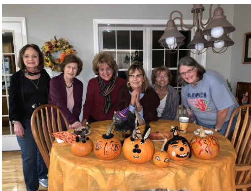
GFWC Blackstone Valley Women's Club