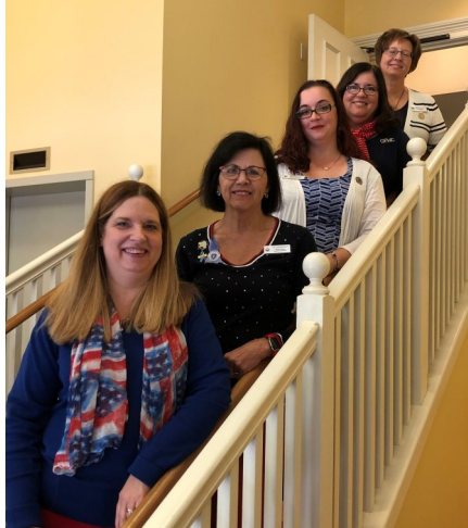
Junior Membership Officers