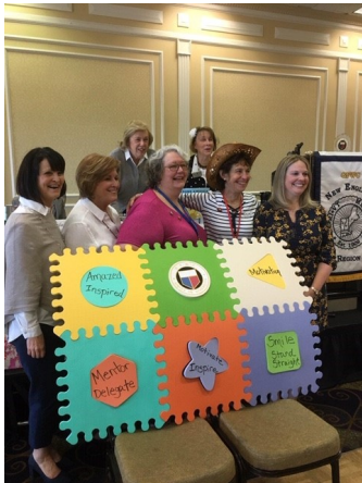
New England's LEADS Candidates