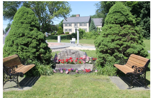
GFWC Pepperell Woman's Club