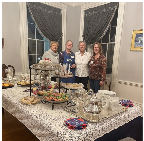
Members of the Tea Committee