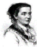
Julia Ward Howe