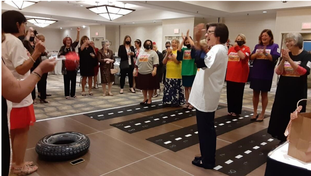
Races at “Westboro Speedway”