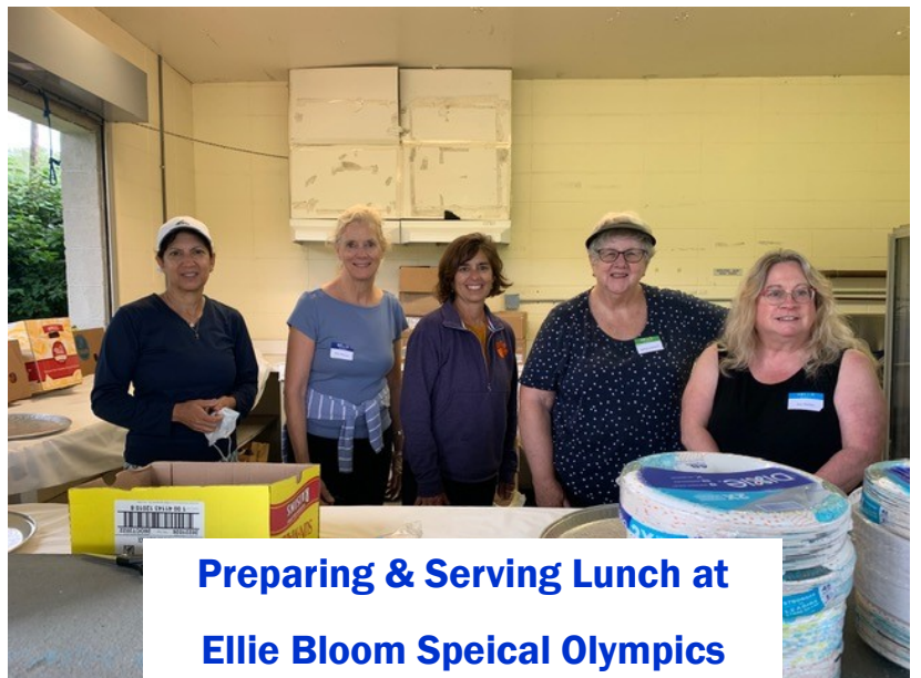
Preparing & Serving Lunch at Ellie Bloom Special Olympics