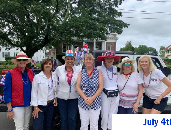
July 4th Parade