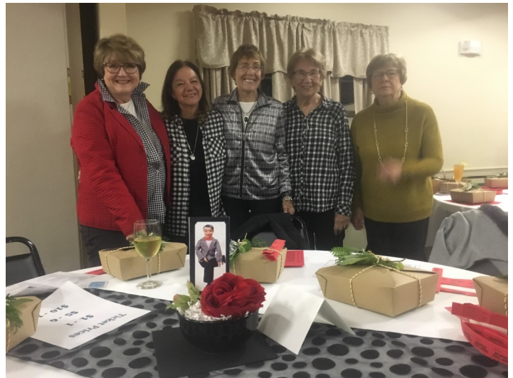
MWC Centerpiece Committee