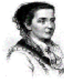
Julia Ward Howe