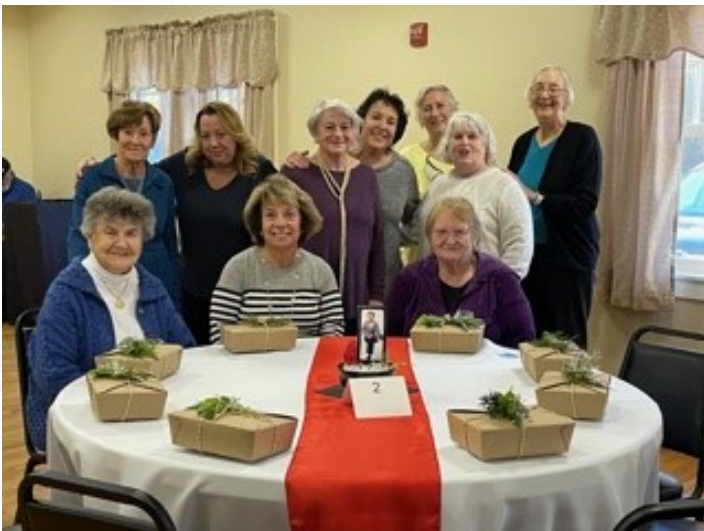
MWC Fundraiser Raffle Committee