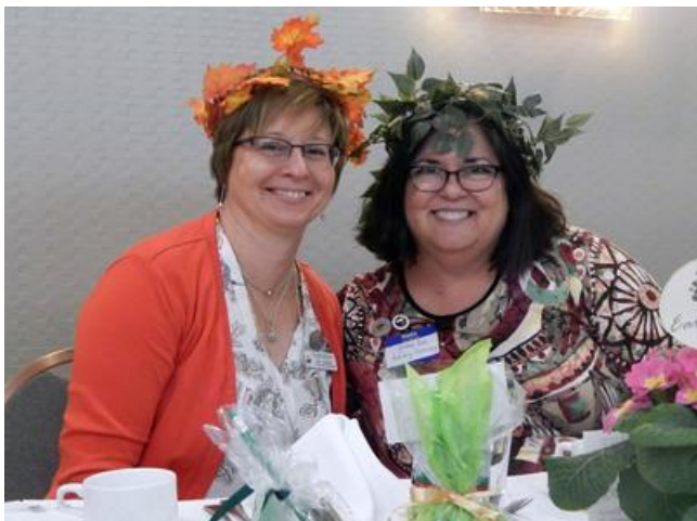
Lovely Junior Officers Celebrating Earth Day at Junior Annual Conference