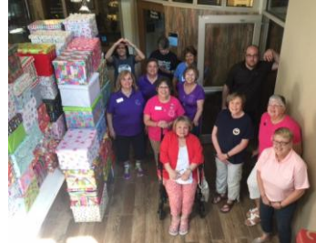
Boxes to the ceiling!! Great job ladies!