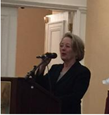
Left: U.S. Representative Niki Tsongas, speaking to Midwinter Meeting attendees about women being critically important in the political arena.