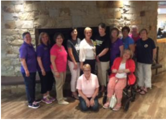
GFWC of MA ready to go!

On Saturday, June 10th twelve GFWC of Massachusetts members (Bay State Contemporary Club) joined with staff and students (100+) of the Massachusetts Youth Leadership Foundation at the annual MassSTAR seminar. GFWC of Massachusetts has been a major sponsor of this hugely successful program for over 13 years. The past few years have seen the attendees work on a service project benefitting the Birthday Wishes organization by wrapping and filling boxes for the "Birthday in a Box" program for kids living in shelters who wouldn't otherwise have a birthday party. Thanks to all from GFWC of Massachusetts for their support!