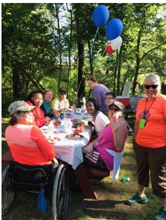
Needham Women's Club honors women veteran's with canoe trip down the Charles River and picnic lunch. What fun!!!