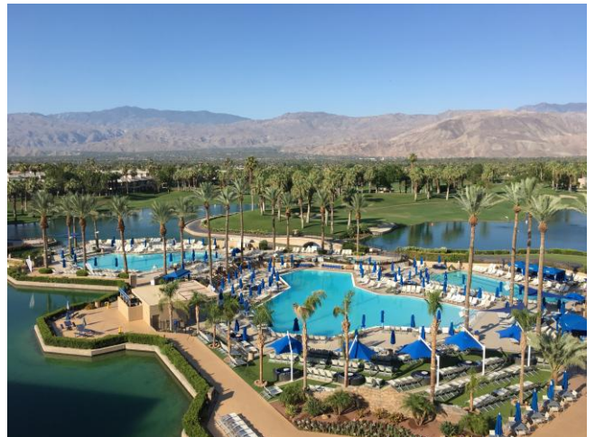
Lovely Room with a View 2017 GFWC International Convention Palm Desert, California