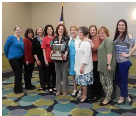
Marlborough Juniors win the P&A Bowl for the first time in 43 years!!