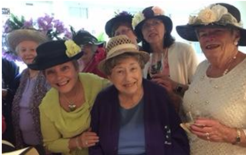
Ladies Looking Lovely on Derby Day at GFWC of Massachusetts Annual Meeting

"Shall I compare thee to a summer's day? Thou art more lovely and more temperate. ...And summer's lease hath all too short a date." William Shakespeare