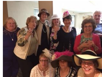
Celebrating the 1898 Society on Derby Day at Annual Meeting! Such a wonderful group of women wearing their finest chapeaux!