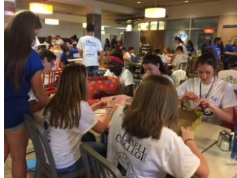
MassSTAR ambassadors busy wrapping! Notice the shirts!