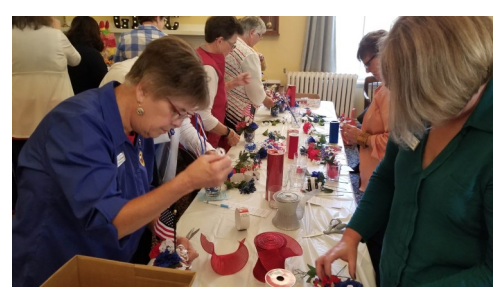
Junior Fall Conference