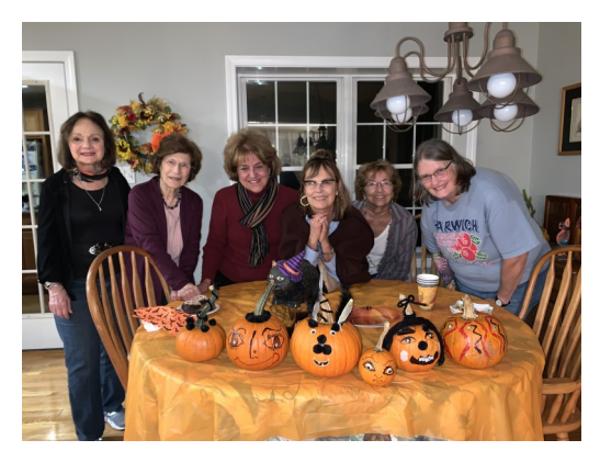
GFWC Blackstone Valley Women's Club