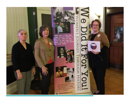
"In the hearts and minds of empowered women, every wall is a door." Melinda Gates The Moment of Lift