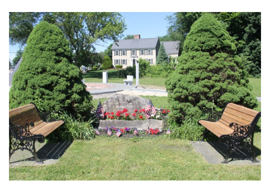
GFWC Pepperell Woman's Club