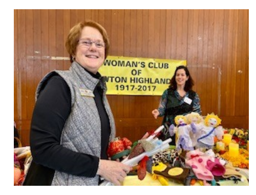
Woman's Club of Newton Highlands