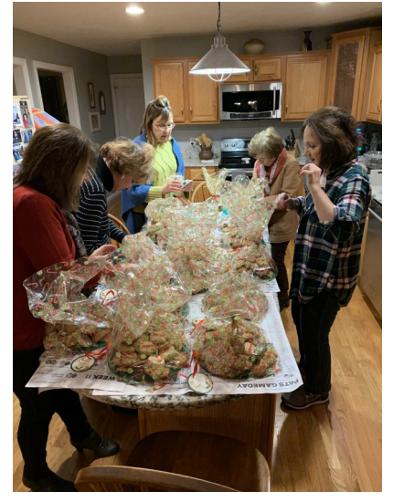
GFWC Blackstone Valley Women's Club