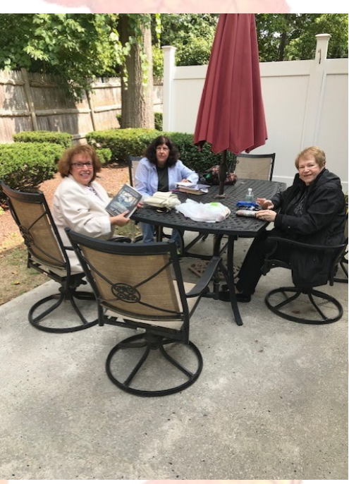
Braintree Women's Club Book Club