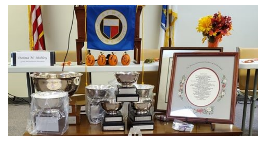
GFWC Massachusetts and Junior Membership Combined Fall Meeting: