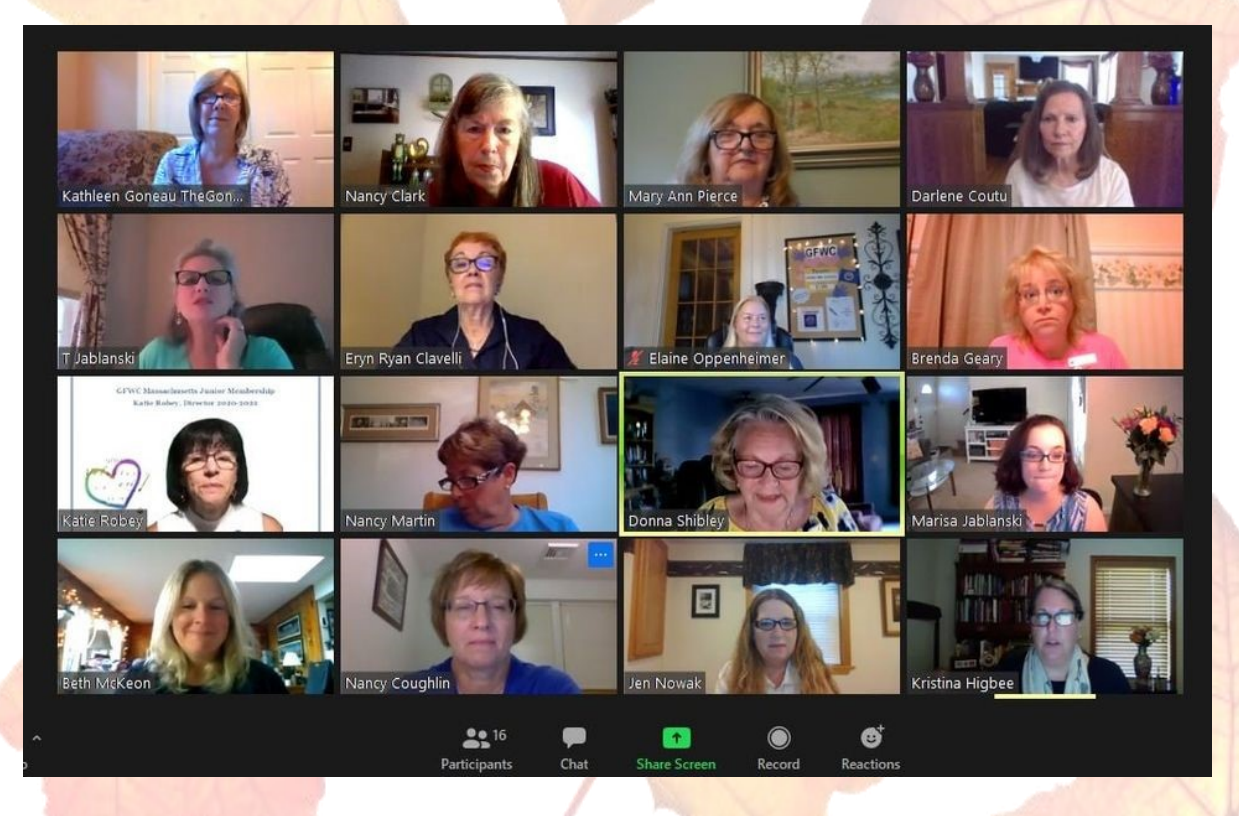
GFWC MA Junior Membership Junior Jumpstart

GFWC Marlborough Junior Woman's Club continued its tradition of delivering thank you baskets to first responders in Marlborough and Hudson on Sept. 11. With Covid restrictions, no homemade goodies were allowed, but members donated packaged items and some shopped with club funds to make up baskets. Members delivered them to our combined nine police and fire stations.