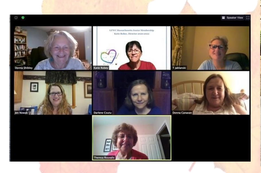
GFWC MA Executive Committee Zoom Meeting

Happy Fall and Happy Holidays to all! Stay well and safe.