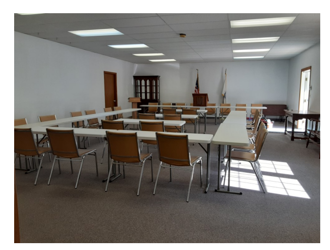
Watch for a refreshing update at Headquarters.