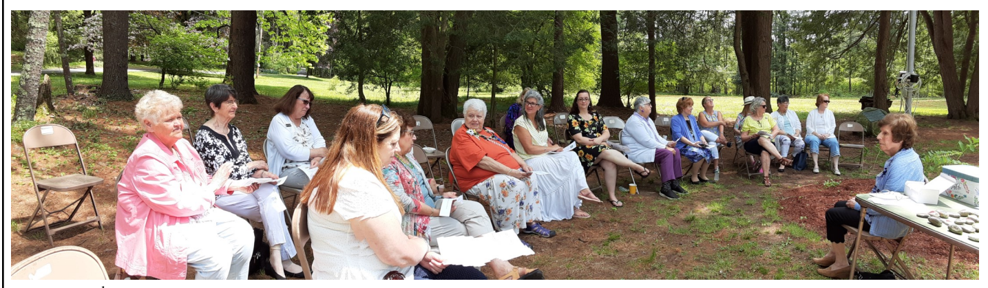
The 72<sup>nd</sup> GFWC Massachusetts Federation Day at the Forest was held at Headquarters on May 21, 2022.