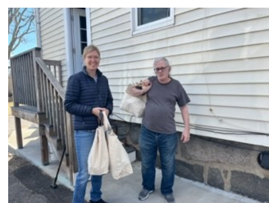
Braintree Women's Club Generous Holiday Donations