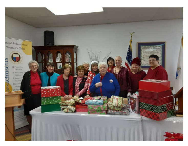
New England team hooded sweatshirts, socks, winter hats, and gloves were wrapped and delivered to Sweats For Vets in time for the holidays.