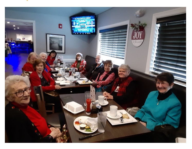
Members of the Boston Parliamentary Law Club enjoyed a holiday lunch at the Sudbury Point Grill.