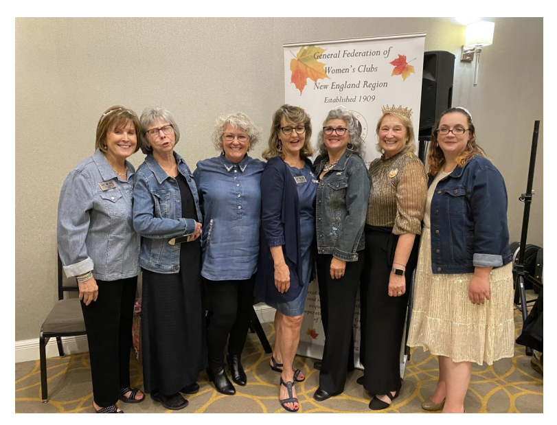
New England State Presidents and Director of Junior Clubs