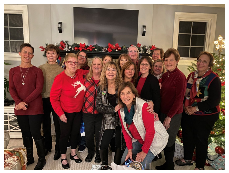
The Holly Club Christmas Party

'Tis the season to be jolly, and on Tuesday, December 5th, the members of The Holly Club did just that!