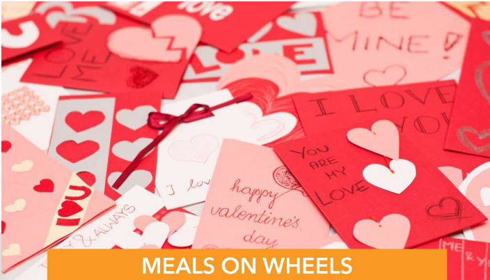
MEALS ON WHEELS VALENTINE CARDS

The GFWC Big Rapids, Inc. Club (MI) gathered around a large table to make Valentine's Day Cards. Members were asked to bring anything they had that could be used on the cards for decoration. A total of 183 cards were created and delivered to shut-in clients of the local "Meals on Wheels" program.