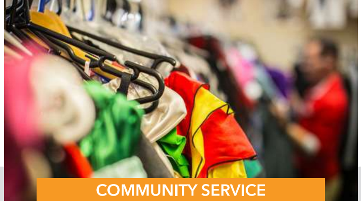
COMMUNITY SERVICE FOR THE ARTS

The GFWC Big Rapids, Inc. Club (MI) gathered around a large table to make Valentine's Day Cards. Members were asked to bring anything they had that could be used on the cards for decoration. A total of 183 cards were created and delivered to shut-in clients of the local "Meals on Wheels" program.