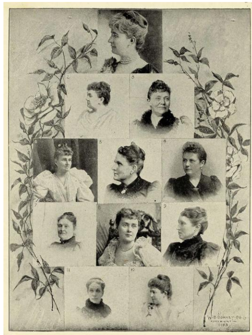
Club Exhibits at the World's Fair