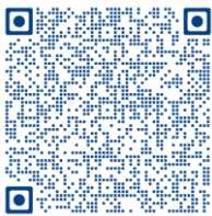
Alzheimer's Virtual Walk