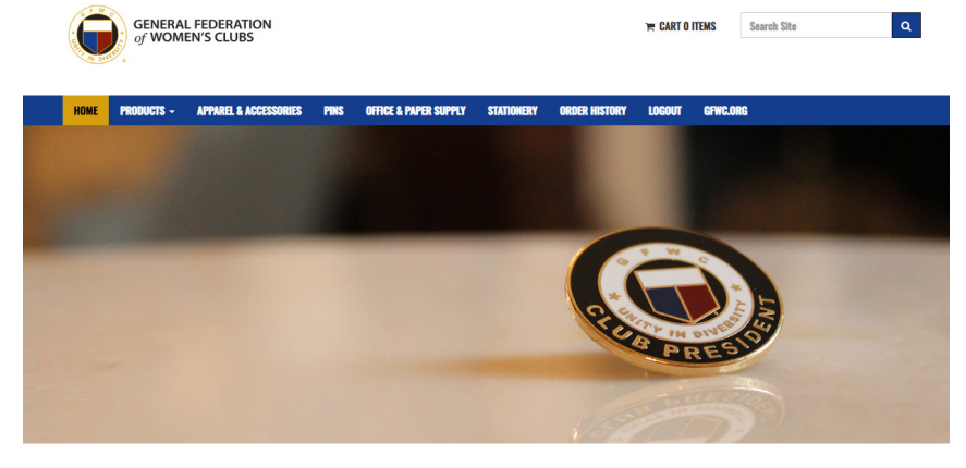
WELCOME TO THE GENERAL FEDERATION OF WOMEN'S CLUBS ONLINE STORE!